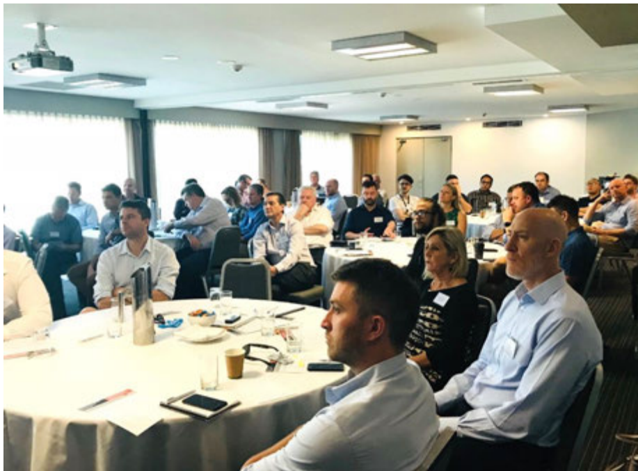
Attendees of the Forum