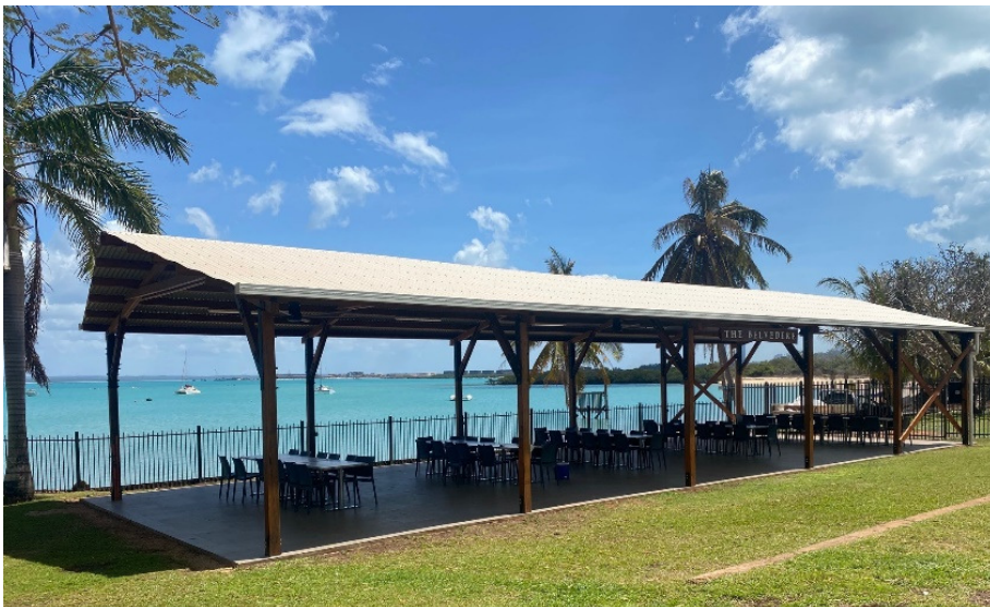
New Shade structure at the Gove Boat Club