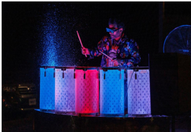
A photo from the Joy of Many Colours event conducted by the Australian Red Cross Society