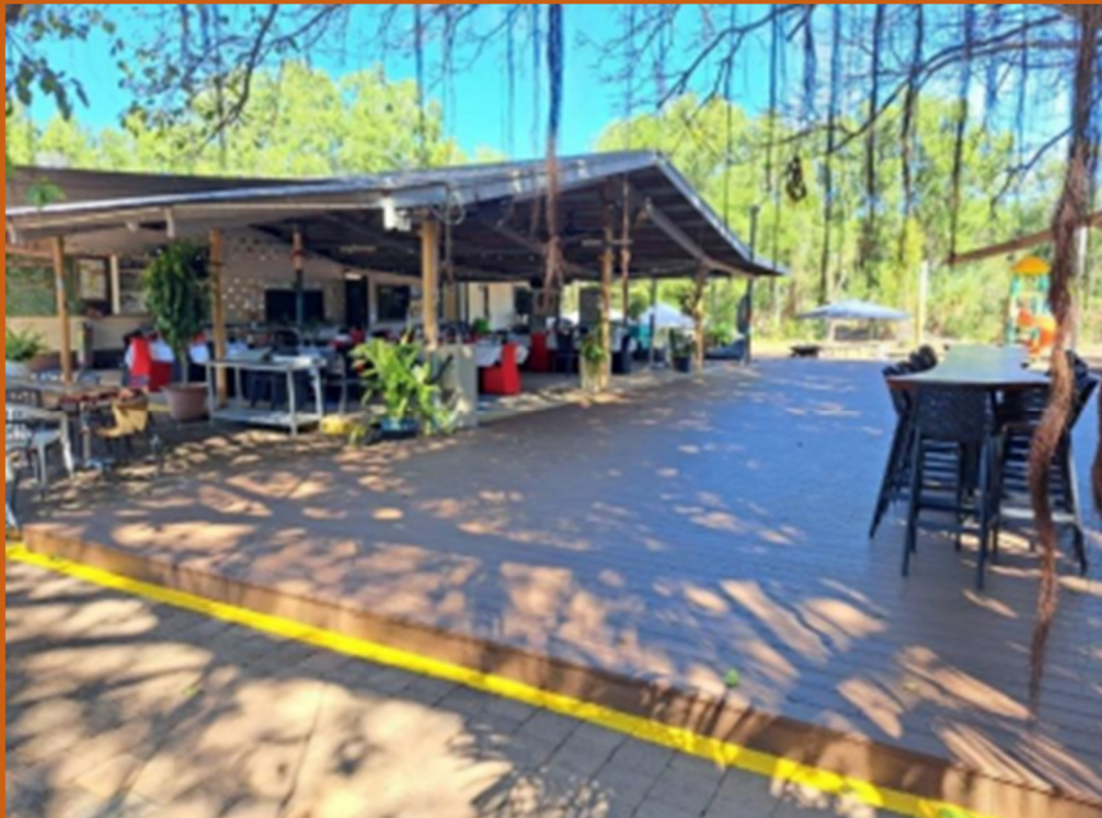
New decking at the Cox Country Club